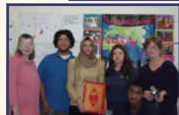
St. Gregory High School Chicago, IL