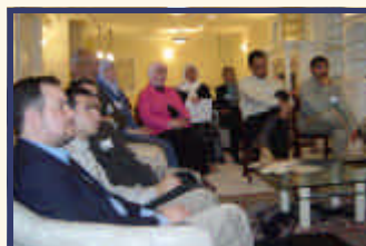
OIS meets with community leaders