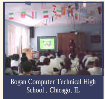
Bogan Computer Technical High School, Chicago, IL